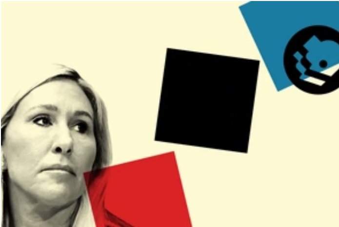
Illustration by The Atlantic.