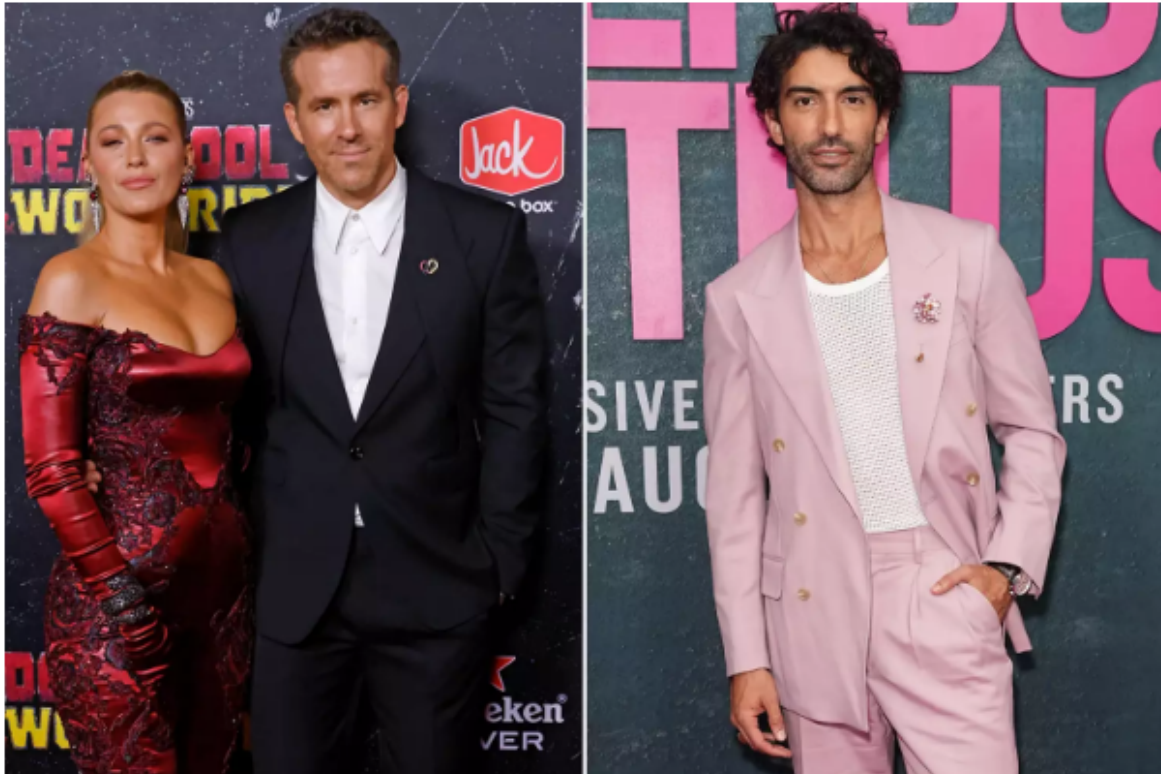
Blake Lively and Ryan Reynolds on July 22, 2024; Justin Baldoni on Aug. 6, 2024.

RELATED: Blake Lively Shares New Selfie with Ryan Reynolds Set to Rolling Stones' 'Wild Horses' amid Justin Baldoni Lawsuits