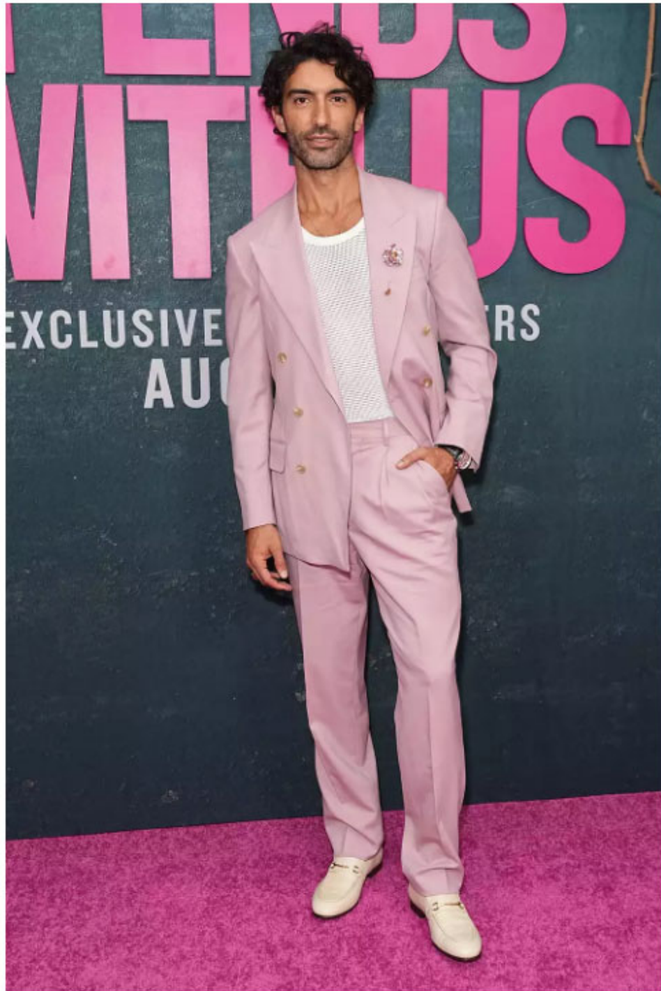
Justin Baldoni on Aug. 6, 2024.