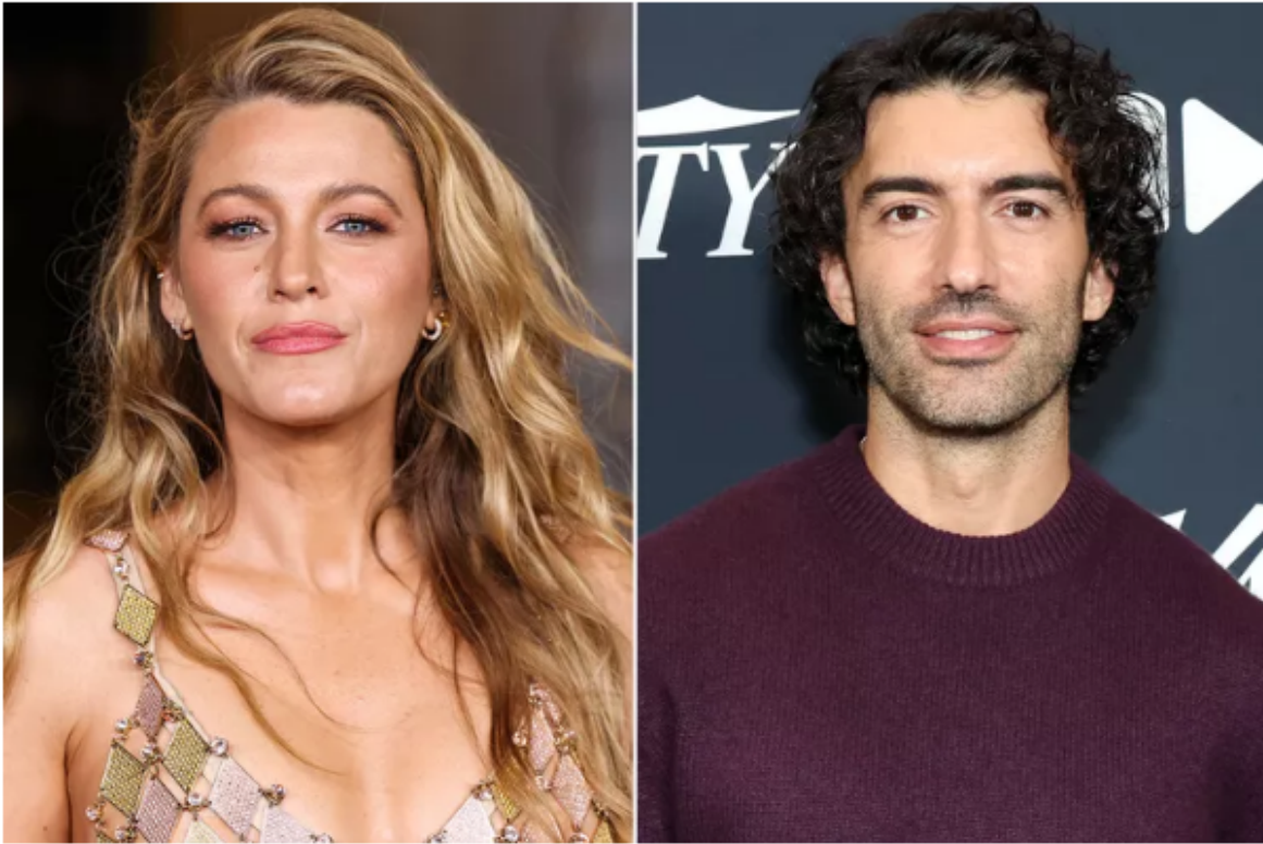
Blake Lively at the 13th Annual LACMA Art + Film Gala on November 2, 2024 in Los Angeles ;Â Â Justin Baldoni attends Variety Faith And Spirituality In Entertainment Honors on December 04, 2024 in Los Angeles.